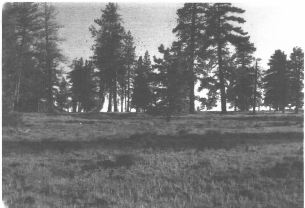
Figure 4— Artemisia arbuscula / Stipa occidentalis var. minor community at Meeks Table Research Natural Area, Washington.