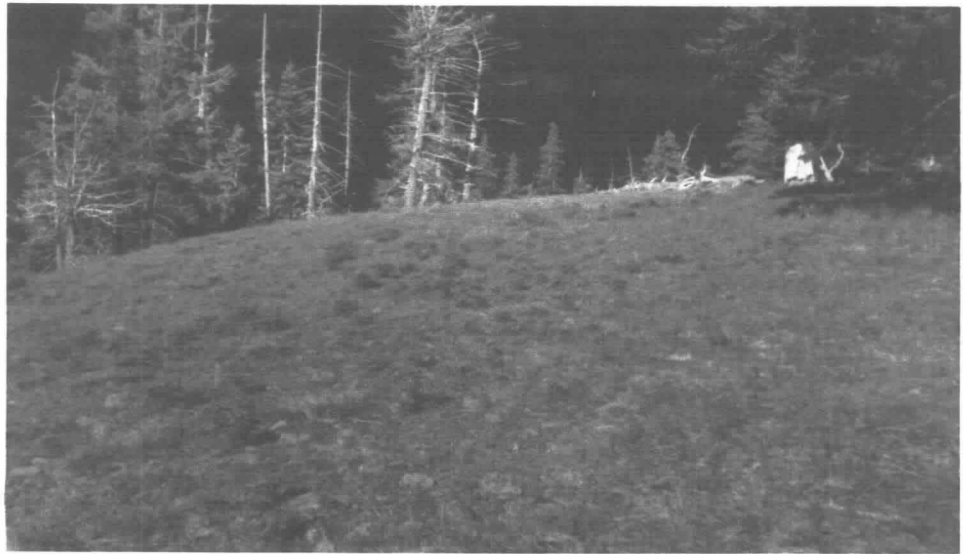
Figure 3— Artemisia arbuscula / Sedum stenopetalum community at Meeks Table Research Natural Area, Washington.