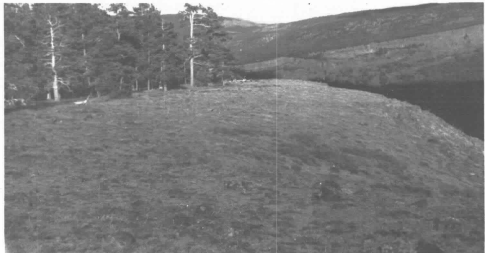
Figure 2— Artemisia arbuscula-Eriogonum douglasii/Poa secunda community at Meeks Table Research Natural Area, Washington.