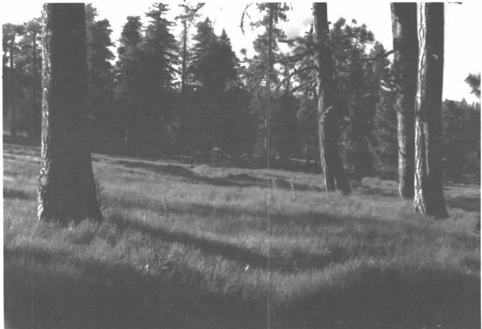
Figure 5— Pinus ponderosa / Calamagrostis rubescens community at Meeks Table Research Natural Area, Washington.

The Pseudotsuga menziesii / Calamagrostis rubescens community occupies 6 ha along the eastern and western ends of Meeks Table. Tiedemann and Klock (1977) describe these areas as Abies grandis / Calamagrostis rubescens / Arnica cordifolia . These areas are currently dominated by Pinus ponderosa with Pseudotsuga menziesii as a minor associate in the tree canopy. Abies grandis and Pseudotsuga menziesii account for a disproportionately large amount of the density in smaller size classes. This suggests eventual replacement of or codominance with Pinus ponderosa in the absence of fire or other natural disturbance. This community also contains the greatest diversity of tree species at Meeks Table; it supports moderate amounts of Larix occidentalis and an occasional Pinus contorta and Picea engelmannii . Understory species are dominated by Calamagrostis rubescens , Carex geyeri , and Arnica cordifolia . Shrubs play a very minor role in the physiognomy and composition of this community.